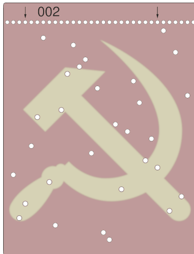
FIGURE 2: Fialka key punchcard

Attached to this challenge are the Cyrillic and English ciphertexts.