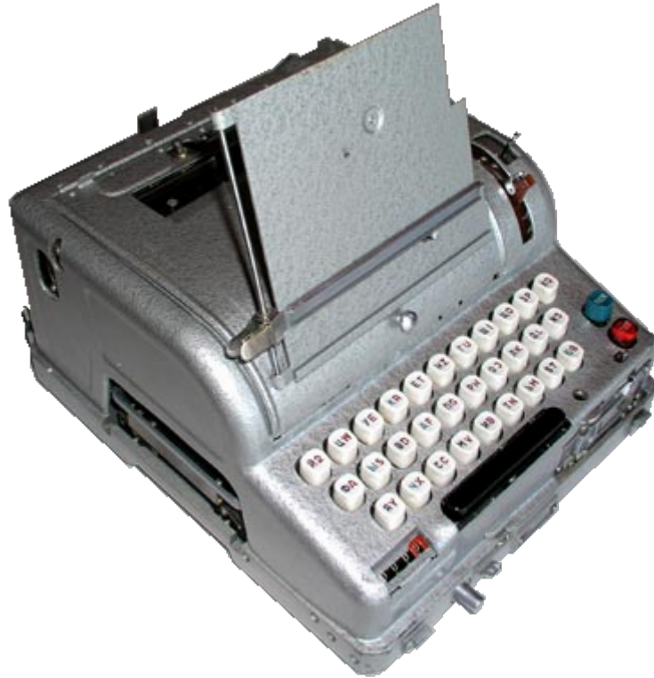
FIGURE 1: The Fialka cipher machine

Fialka was an electro-mechanical rotor cipher machine used by the USSR during the Cold War. Like Enigma, it had rotors and a reflector. There were ten rotors, and the plugboard was replaced with a punchcard reader that could effect a full permutation of the alphabet. The alphabet that it used was a subset of the Russian one and had thirty letters.